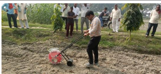
FLD under Ag. Engineering