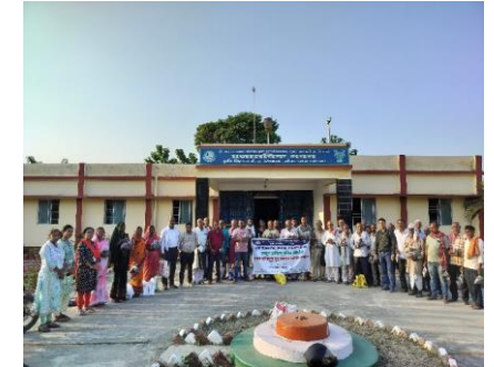
Critical Input Distribution