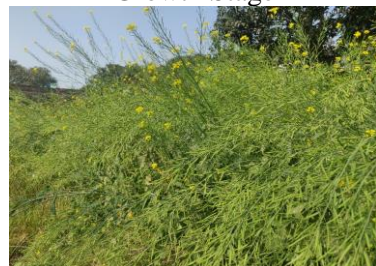
Pod Formation stage