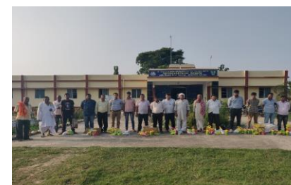
Training cum critical inputs distribution