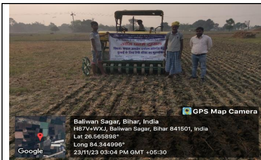
Wheat sown by Zero till drill)