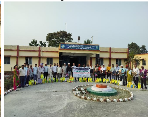
Critical Input Distribution