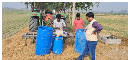
Application of decomposer in paddy straw