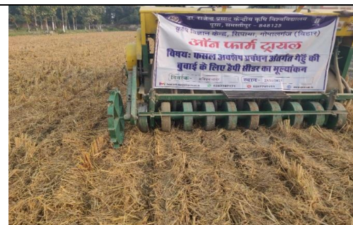
Sowing of wheat by Happy seeder incorporating the crop residue