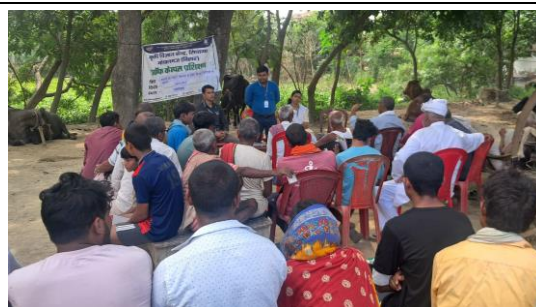
PF training under Ag. Engineering discipline