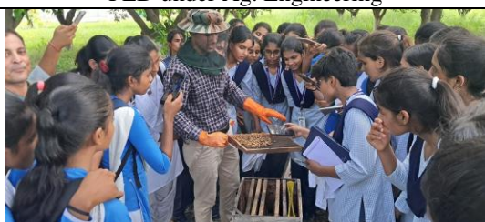
Exposure visit of JNV students