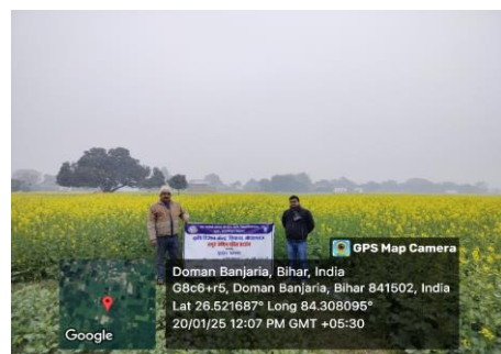
Pod Formation stage