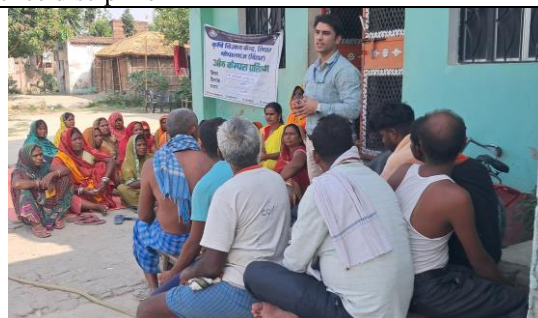
PF training under Plant Protection discipline