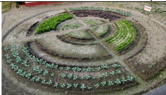
Poshan Vatika at KVK Gopalganj