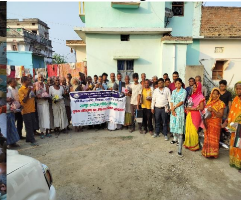
Critical Input Distribution