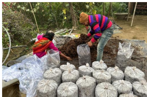
Oyster Mushroom Cultivation