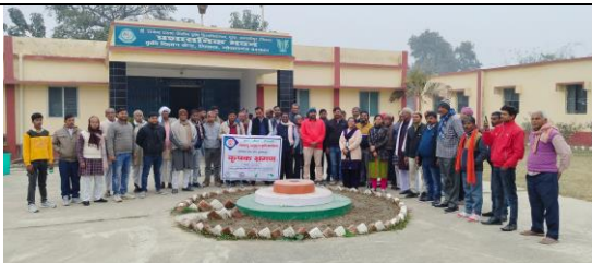
Exposure visit of farmers from KVK Saraiya at KVK Gopalganj