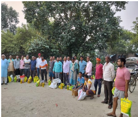
Critical Input Distribution