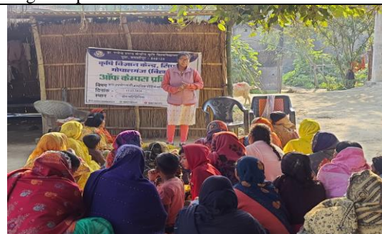
PF training under Home Science discipline