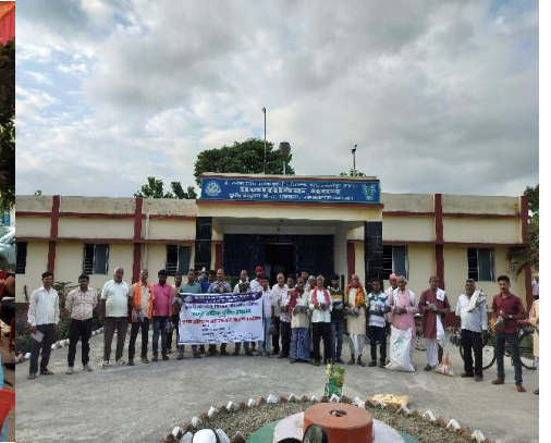
Critical Input Distribution