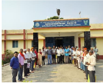
Critical Input Distribution