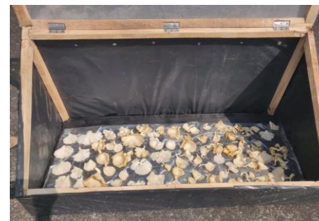
Sun drying using low cost solar dryer